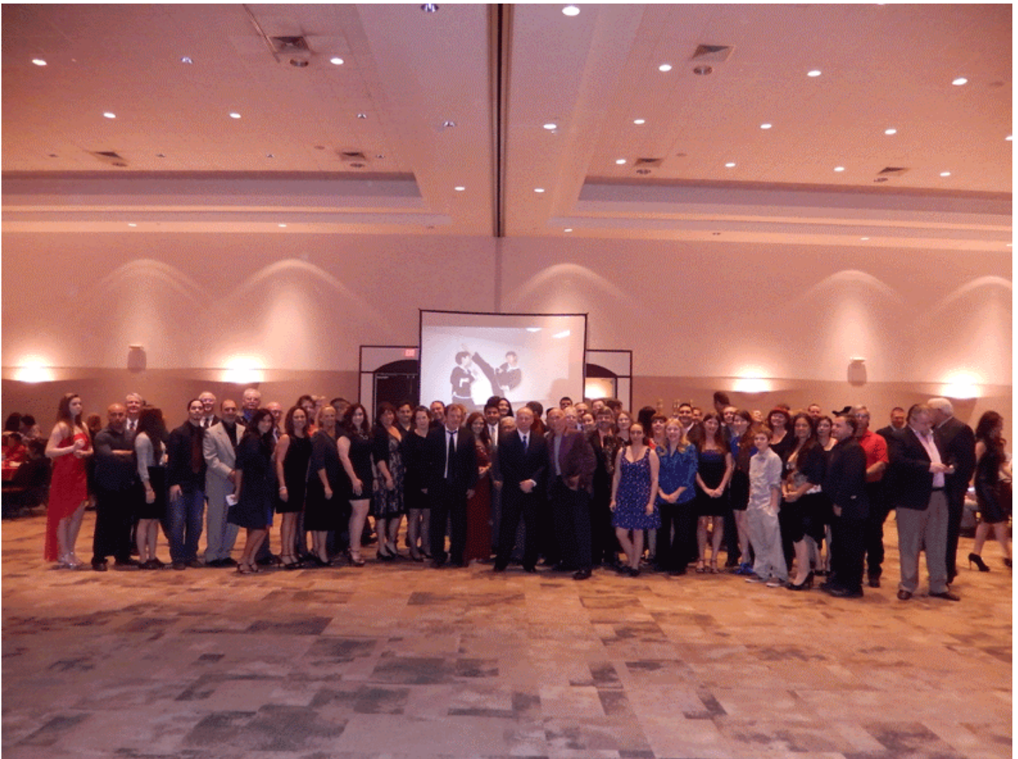
ASK group picture. Master Bill Gray & Grandmaster Bill "Superfoot" Wallace (center).

For the benefit of everyone's health, eat vegetables, fruits, grains and be kind to all animals (& people). World Peace is possible and can be achieved.